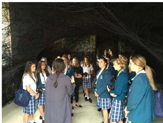
Year 9 students looking at Chiharu Shiota's work.