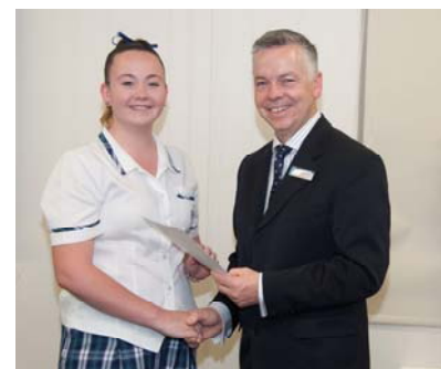
ADF Long Tan Award

Agriculture Commerce Dance Design and Technology Drama English English English Honours Food Technology Geography History Japanese Mathematics 5.2 Mathematics 5.3 Music Personal Development Health and Physical Education Photography & Digital Media Physical Activity and Sports Studies Religious Education Religious Education Science Studies of Religion II (Preliminary Course) Visual Arts